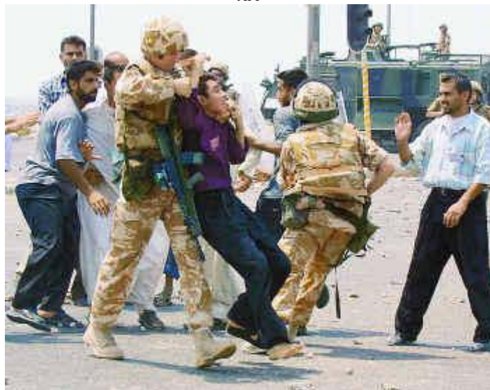
Iraq.. a new type of war waged with super weapons.

In the best-selling version of popular mvth as historv. U.S. "goodness" peaked during