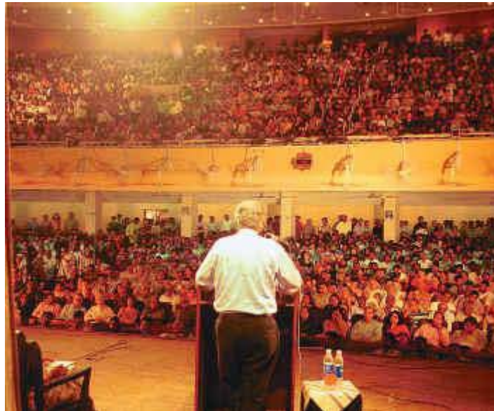
Noam Chomsky ... weaving his spell over Chennai in November 2001. He spoke on "September 11 and its aftermath".

Thanks to the seductive charms of Hollywood and the irresistible appeal of America's mass media, all these years later, the world views the war as an American story. Indochina provided the lush, tropical backdrop against which the United States played out its fantasies of violence, tested its latest technology, furthered its ideology, examined its conscience, agonised over its moral dilemmas, and dealt with its guilt (or pretended to). The Vietnamese. the Cambodians. and Laotians were only script props.