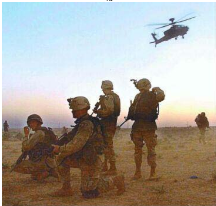
The U.S. 'empire' rests on a grisly foundation.

Prime Minister Silvio Berlusconi, for instance, has a controlling interest in major Italian newspapers, magazines, television channels, and publishing houses. "[T]he prime minister in effect controls about 90 per cent of Italian TV viewership," reports the Financial Times . What price free speech? Free speech for whom? Admittedly, Berlusconi is an extreme example. In other democracies — the United States in particular — media barons, powerful corporate lobbies, and government officials are imbricated in a more elaborate, but less obvious, manner. (George Bush Jr.'s connections to the oil lobby, to the arms industry, and to Enron, and Enron's infiltration of U.S. government institutions and the mass media — all this is public knowledge now.)